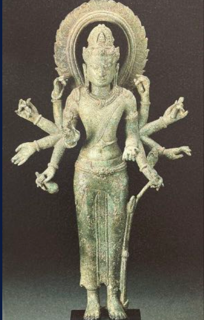
Right: 8-armed Avalokiteshvara Indonesia, 8-9th c Musée Guimet, Paris, France