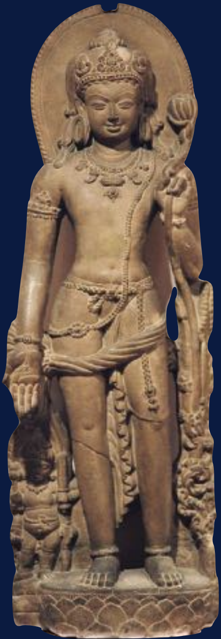
left: Kasharpana Lokeshvara Nalanda, Bihar, India, ca 9th c