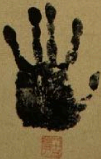
Hand by Nantenbo (1839-1925) Japan Ink on paper, 54.5 x 12.25 " Howie Collection