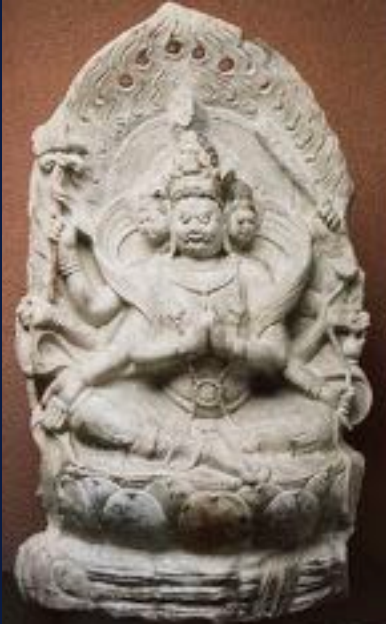
Bodhisattva Avalokiteshvara with a horse's head (Matou Guanyin); Forest of Steles, Xi'an, Shaanxi Province, China, Tang dyanasty, mid-8th c; excavated in 1976