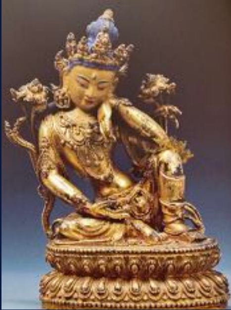
Avalokiteshvara in Posture of Ease China, Ming dynasty, Yongle period (1403-1424); copper alloy, gold gilt; 21.5cm Potala, Lhasa late 5th c