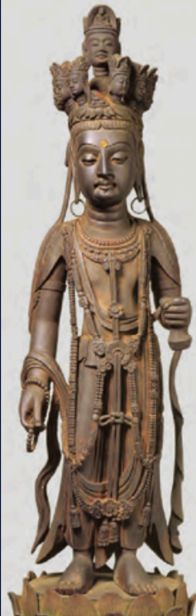
Right: 11-Headed, 2-armed Avalokiteshvara Chinese, brought to Japan by Jyoe? in 665 wood with pigments, 42.1 cm Tokyo National Museum. From Nara National Museum (2005,Pl.4)