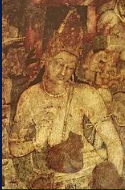
Bodhisattva Avalokiteshvara as Padmapani ZCave 1, Ajanta, Maharashtra Province, India