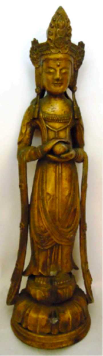
Left: Avalokiteshvara (Guan- neum) in Cintamani form Korea, other info unknown