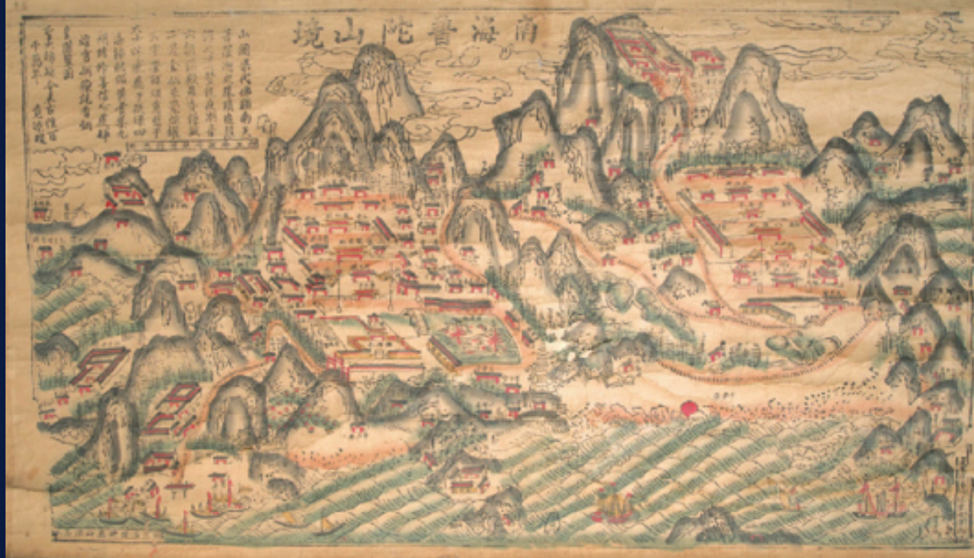
Above: A View of Mt. Putuo of the Southern Sea China, late 19th c pigment on paper, ca 25.5 x 40 " Division of Anthropology, American Museum of Natural History (70/11655)