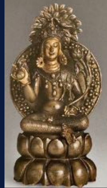
Avalokiteshvara attributed to the 10th Karmapa Choying Dorje Tibet, 17th c