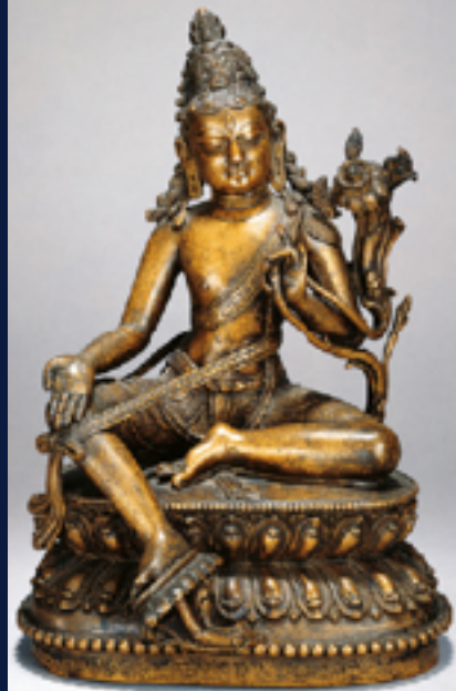
Bodhisattva Avalokiteshvara, Western Tibet, 15-16th c; copper alloy, 7.5"; Asia Society, New York. Gift from The Blanchette Hooker Rockefeller Fund, 1994.4