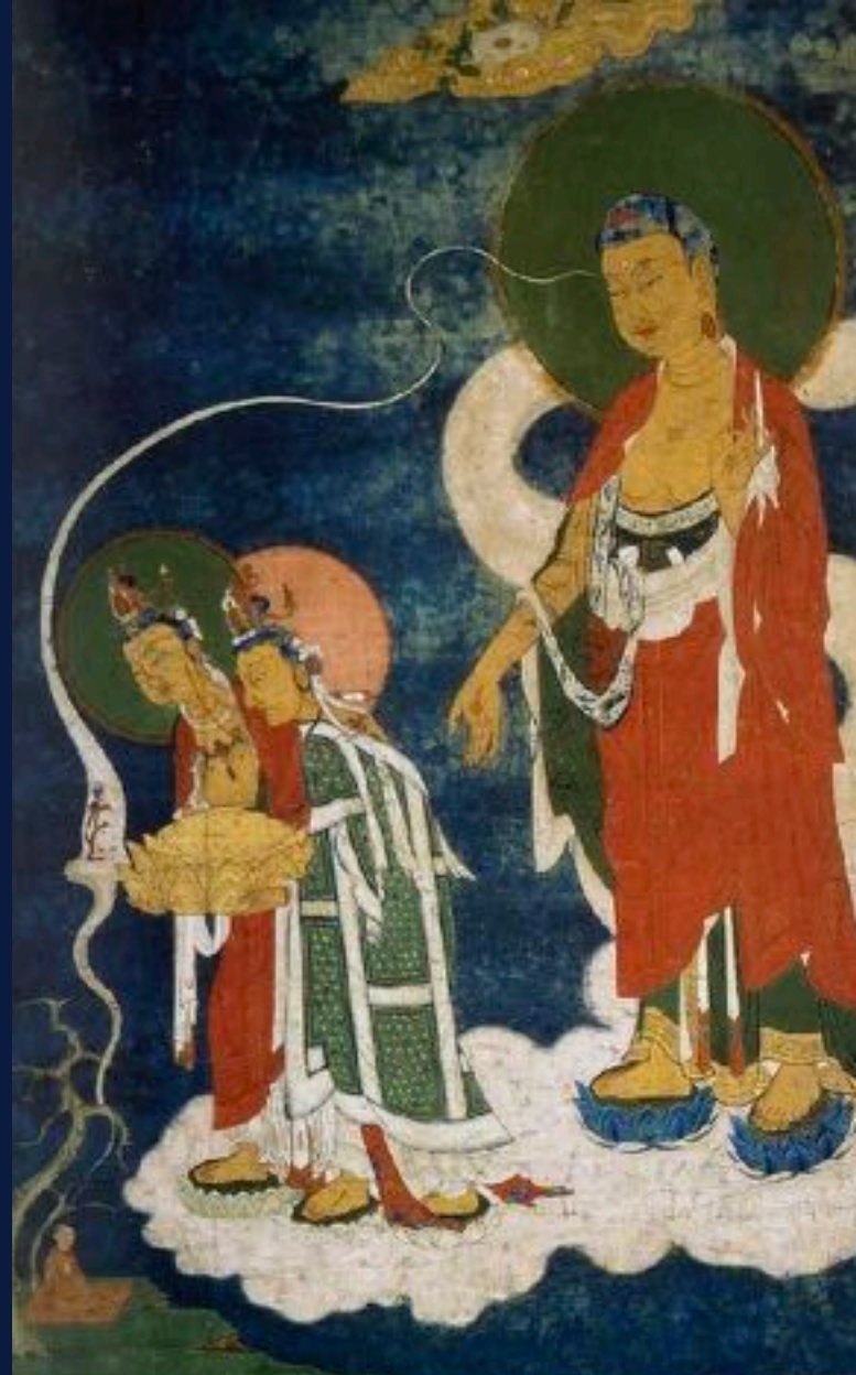
Right: Greeting a righteous man on the way to the Pure Land of Amitabha Central Asia, Khara Khoto, late 12th to early 14th c ink, colours on linen, 142.5 x 94 cm State Hermitage Museum, St. Petersburg