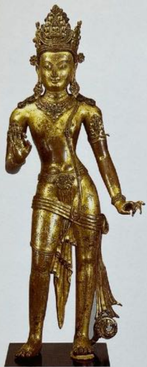
Right: Bodhisattva Avalokiteshvara Nepal, Transitional period, late 10th to early 11th c; gilt copper alloy with inlays of semi-precious stones, 26.75" Asia Society, New York, Mr and Mrs John D Rockefeller 3rd Collection, 1979.47