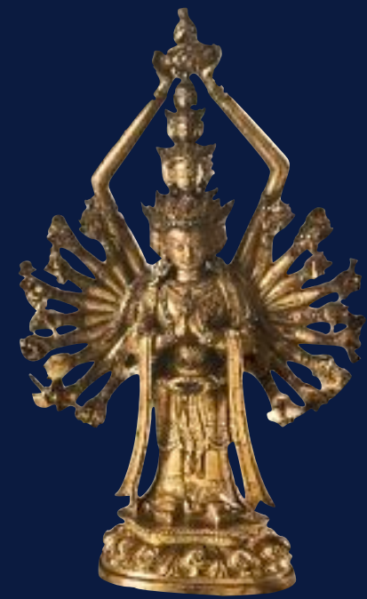
Above: 11-headed, multi-armed Avalokiteshvara Kotan, 18th c. Exhibition Catalog, State Hermitage Museum, St. Petersburg, Russia, 2015 (in Russian) (2010a.C.158)