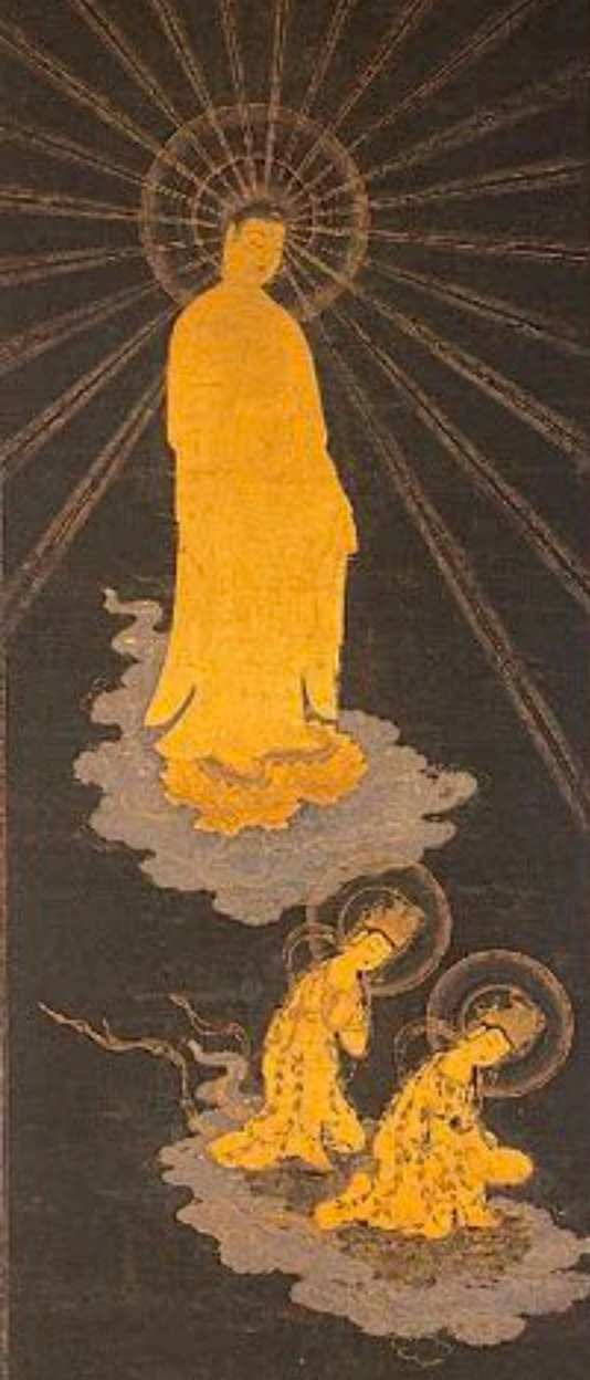
Left: Descent of the Amida Trinity Japan, Kamakura period, early 14th c ink, colours, gold on silk, 120.4 x 41 cm Private Collection from New South Wales Museum catalog