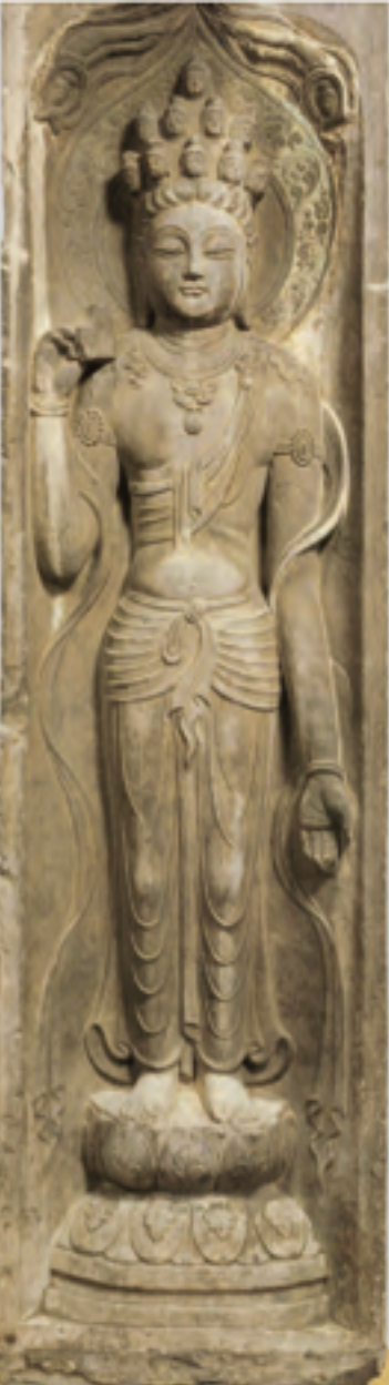
Left: 11-Headed, 2-armed Avalokiteshvara Chinese, Qibaotai, Chang'an, Tang dynasty, early 8th c stone, 85.1 cm Nara National Museum (2005,Pl.1)