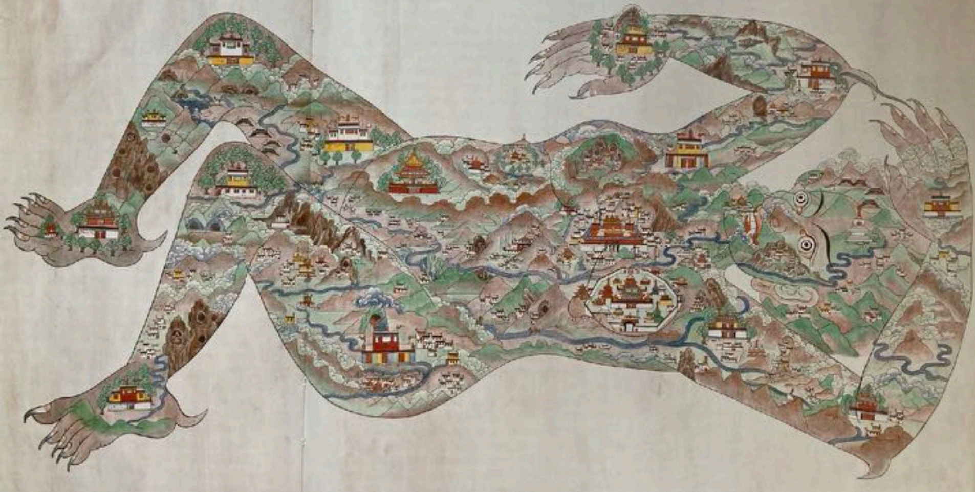
The Demoness of Tibet (symbolic offspring of Avalokiteshvara and Tara) Tibet; late 19th–early 20th century; Pigments on cloth; Rubin Museum of Art; C2006.1.1 (HAR 65719)