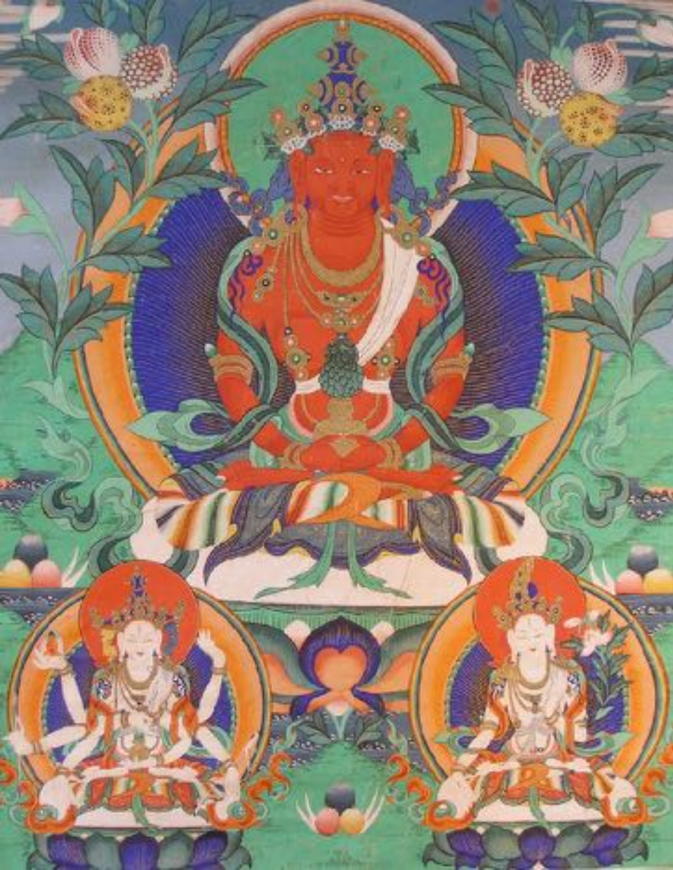
Tibetan Buddhist Red Avalokiteshvara as a meditational diety for long life, health and well-being modern thangka source unknown