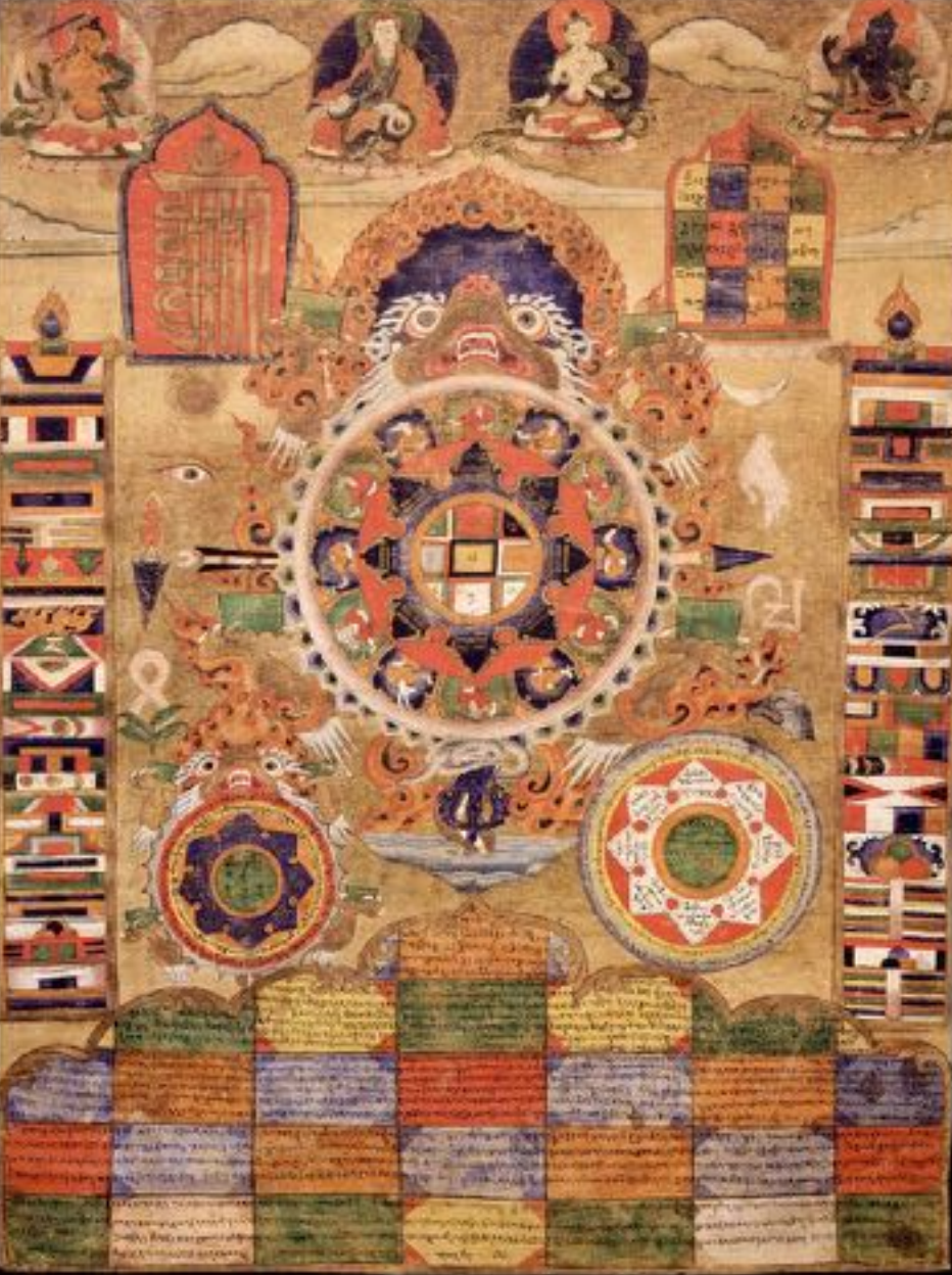
Astrological Talisman and Cosmological Chart Tibetan Buddhist Thangka