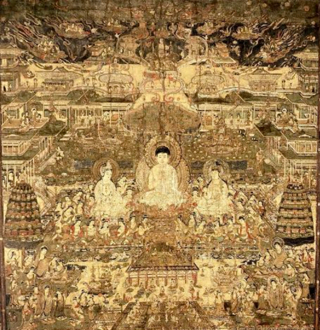
The Pure Land of Buddha Amitabha (Amida), or Taima Mandala Japan, Kamakura period, 14th c ink, colour, gold on silk, 140 x 134.8 cm The Severance and Greta Milikin Purchase Fund 1990.82. The Cleveland Museum of Art