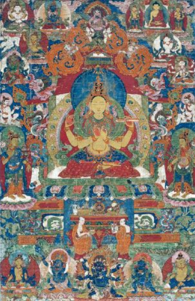
Left: Lady Prajnaparamita as Mother of the Victorious and Noble Ones Tibetan Buddhist Tradition provenance unknown