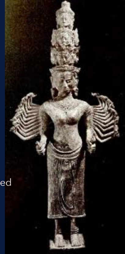
Right: Multi-armed, 11-headed Prajnaparamita Cambodia, 7th c Bronze, 21.5" Private Collection, New York