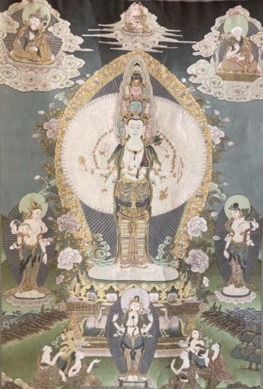
1000-armed, 11-headed Avalokiteshvara with standing 4-armed Avalokiteshvara and two Bodhisattvas Upper left: Padmasambhava, Upper right: Patrul Rinpoche, Top center: Amitabha Thangka, Eastern Tibet, 19th c Private