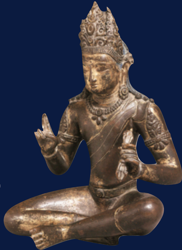
right: Vajrapani Bodhisattva Nepal, 11th c metal Private HAR (item no. 19879)