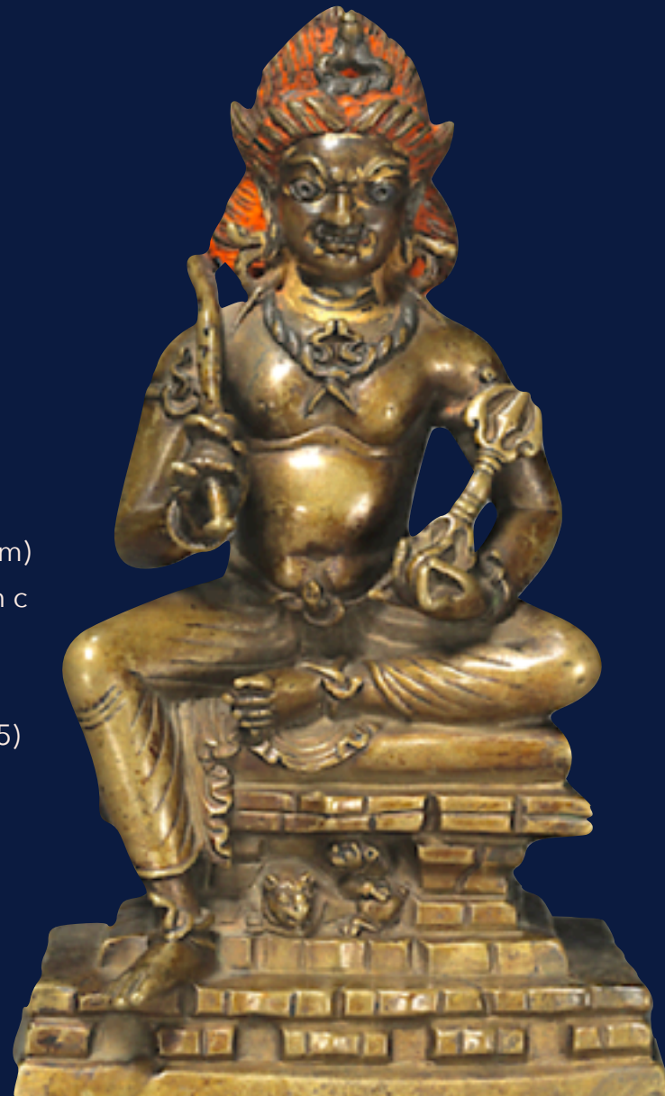
right: Vajrapani (vajrayana fierce form) Northern India, 11th c metal Private HAR (item no. 59255)