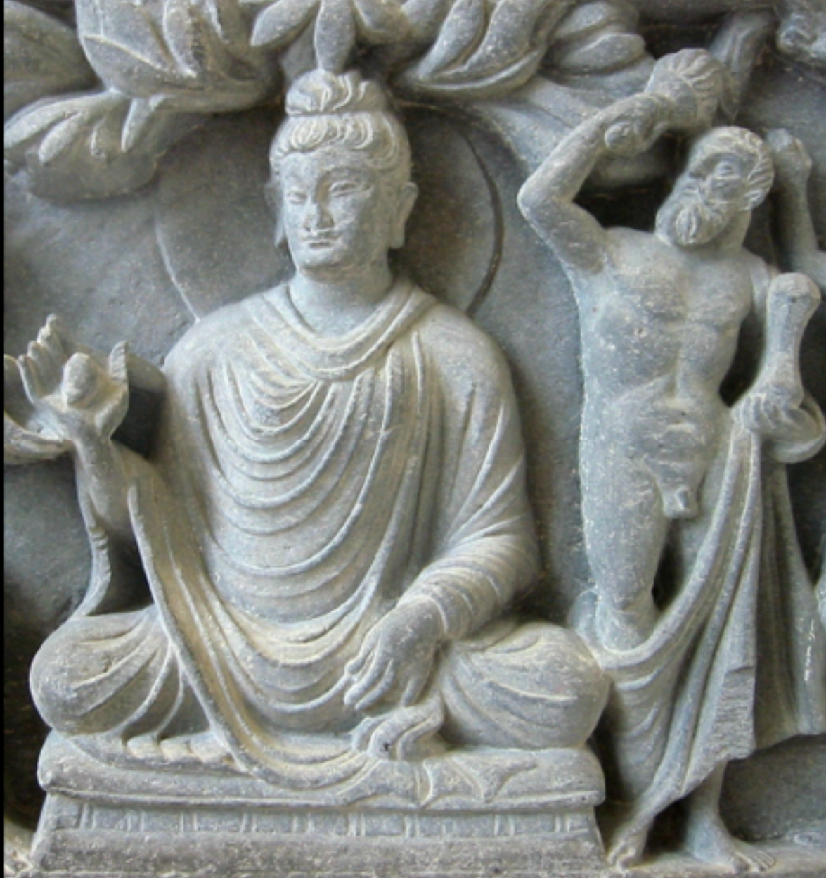
Vajarpani as Hercules attending Shakyamuni Buddha