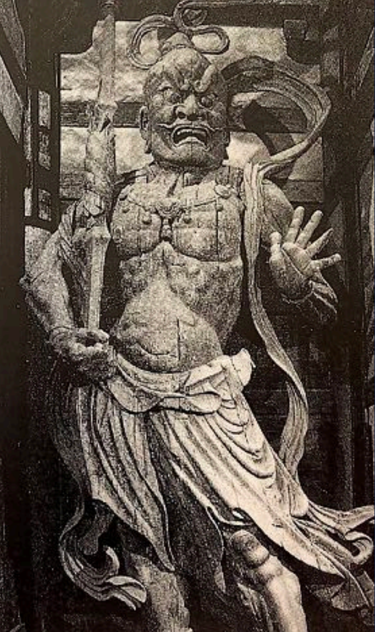
left: Nio by Unkei 1203 Japan, Kamakura period South Gate, Todaiji, Nara wood, 8.08 meters