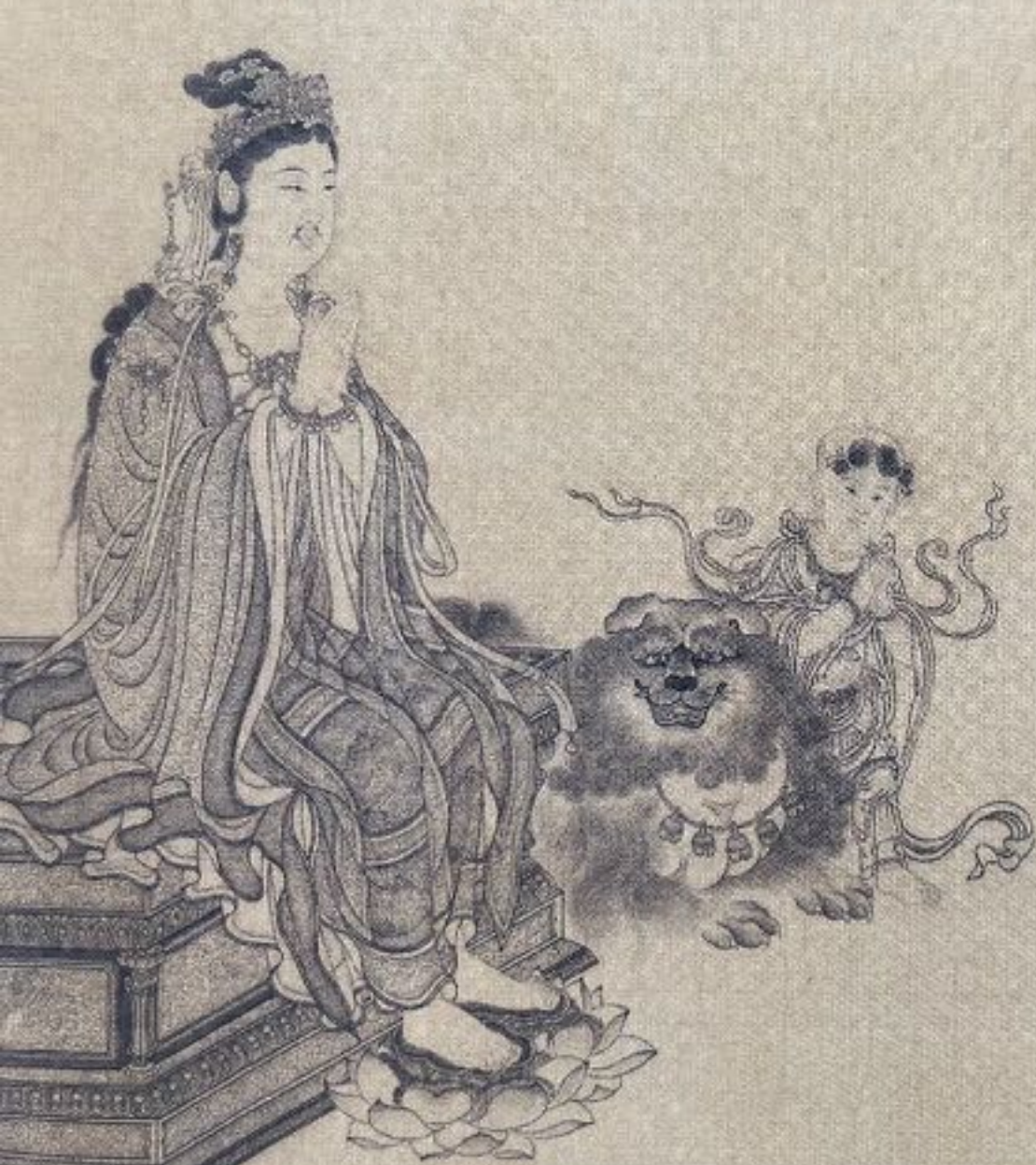
detail depicting Manjushri from Vimalakirti and the Doctrine of Nonduality by Wang Zhenpeng (active ca. 1280-1329) dated 1308; ink on silk. The Dillon Fund Gift, 1980 (1980.276), The Metropolitan Museum of Art, New York