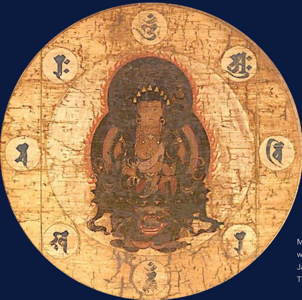
Manjushri Bodhisattva (Jap: Monju Bosatsu) with 8 sacred Sanskrit syllables Japan, Nanbokuchu period (1336-1392) The Metropolitan Museum of Art, New York