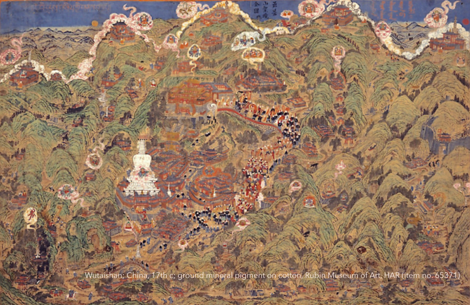
Wutaishan; China, 17th c; ground mineral pigment on cotton, Rubin Museum of Art, HAR (item no. 65371)