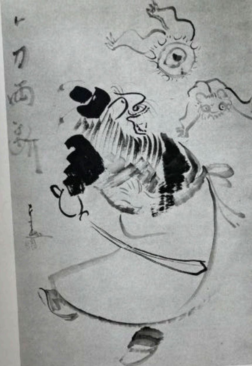
Shoki Killing a Demon by Sengai (1750-1838) ink on paper, 34 x 23" Sanso Collection, USA