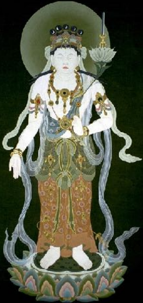
left: Manjushri (Jap: Monju) Japan source unknown