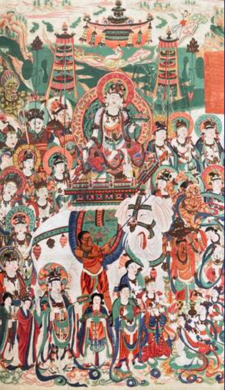
Left: Samantabhadra Right Manjushri

mid 19th century watercolour reproductions of wall frescoes from Dunhuang, ca 15th c