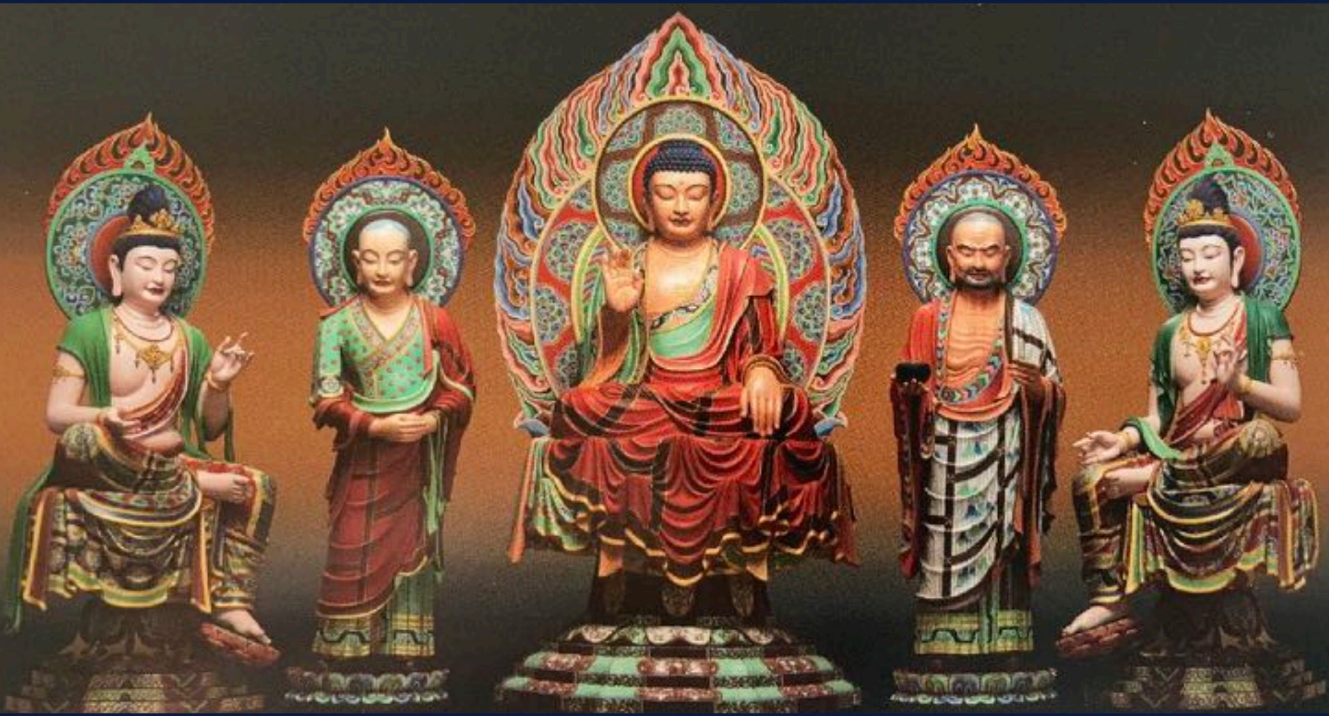
Contemporary replicas of Painted Stucco Sculptures of Buddha, Bodhisattvas and Disciples from Duguang, Mogao Caves (left to right: Samantabhadra Bodhisattva, Venerable Ananda, Buddha Shakyamuni, Venerable Mahakasyapa, Manjushri Bodhisattva)