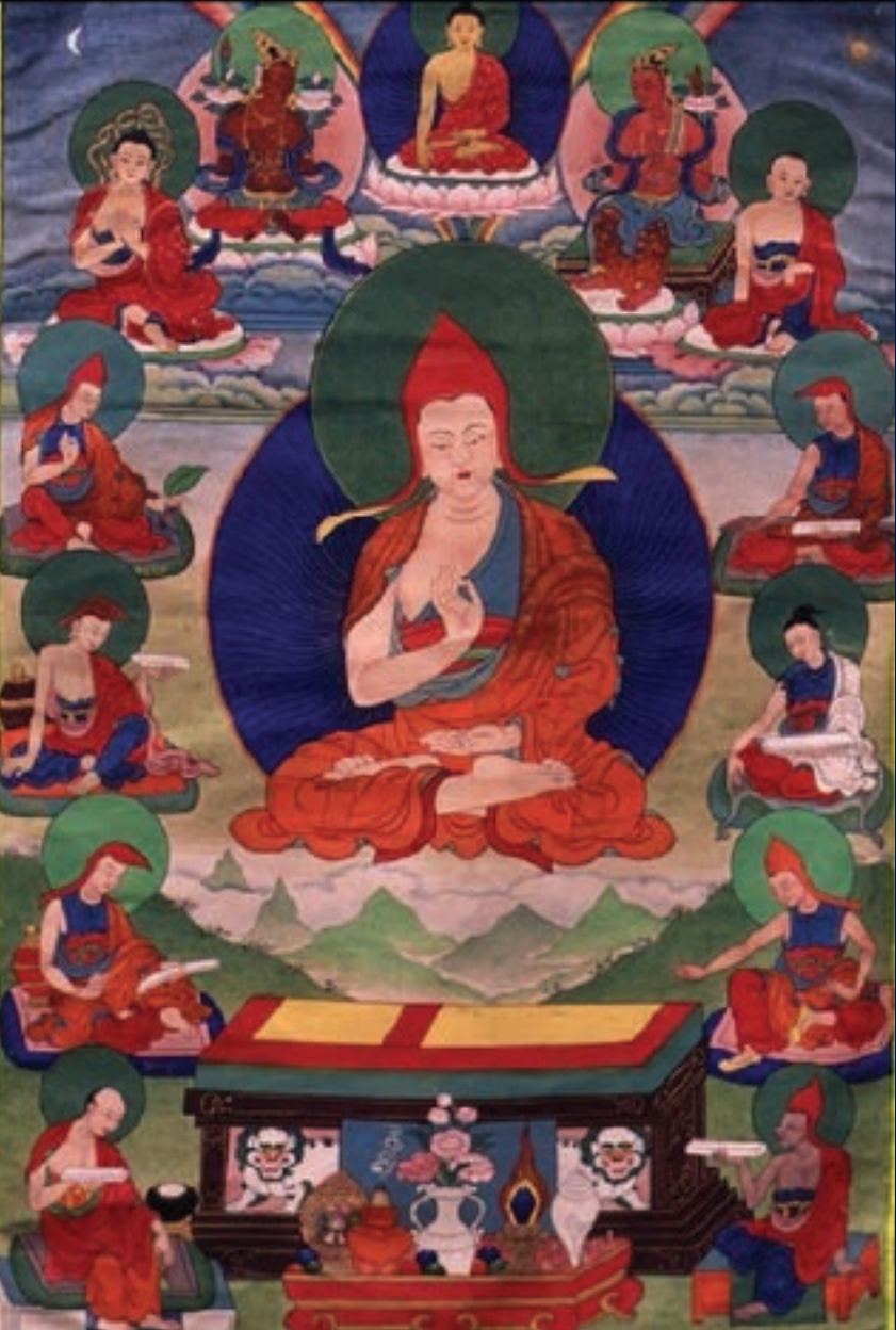
Santideva surrounded by the Six Ornaments and the Two Jewels of the Southern Continent Eastern Tibet, 1900-1959 ground mineral pigment on cotton, size unknown