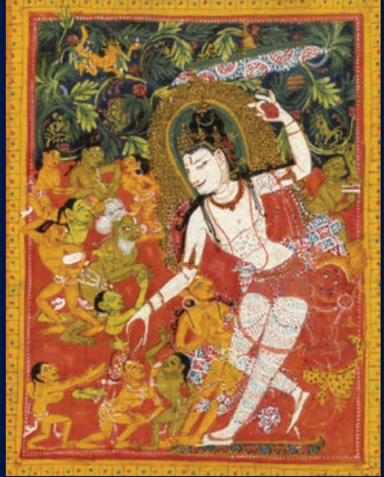
Left: Maitreya Teaching in Tushita Heaven, Right: Bodhisattva performing acts of generosity from the Sanskrit Atsahasrika Prajnaparamita manuscript; India, early 12th c; dimensions unknown