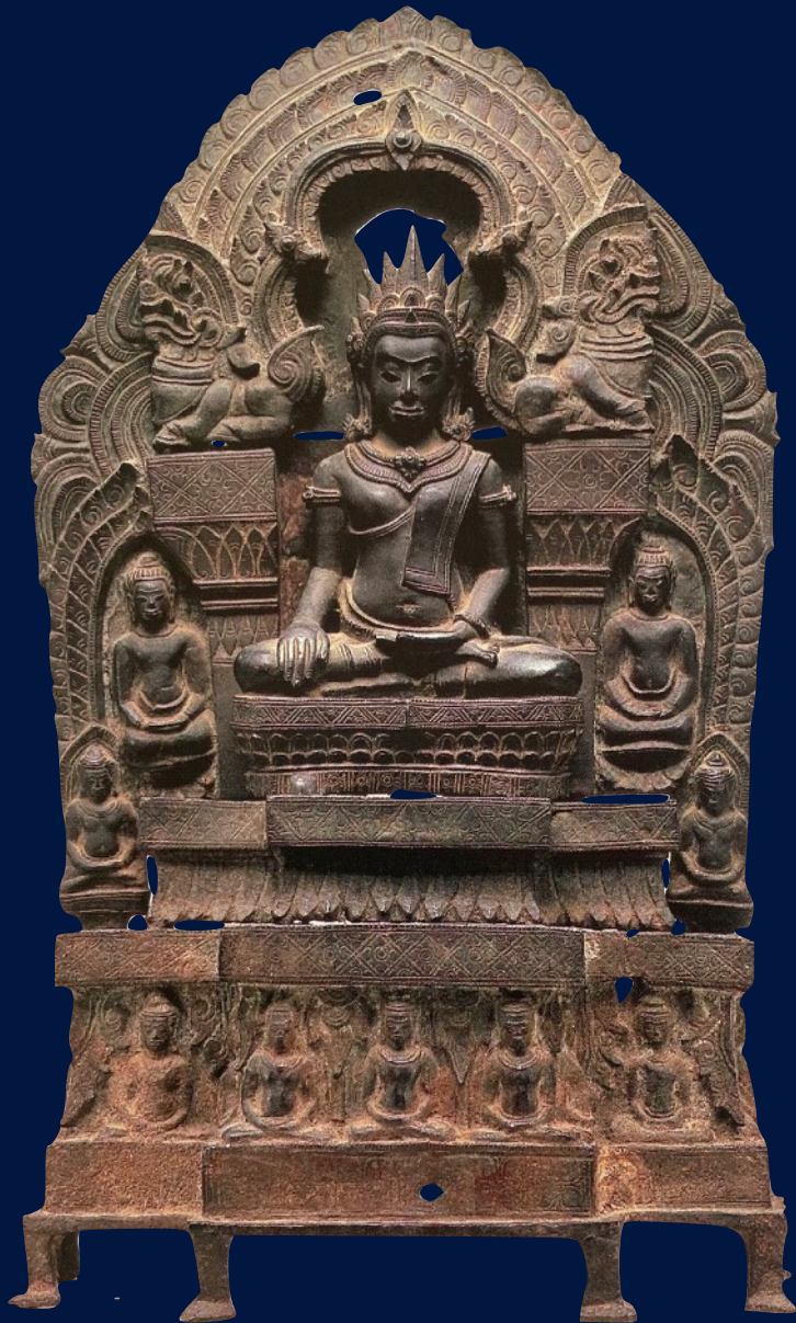
Altarpiece with crowned Buddha, Thailand, Lopburi style, ca. 1250-1299; bronze, 48.6 cm; National Gallery of Australia. Purchased 1979