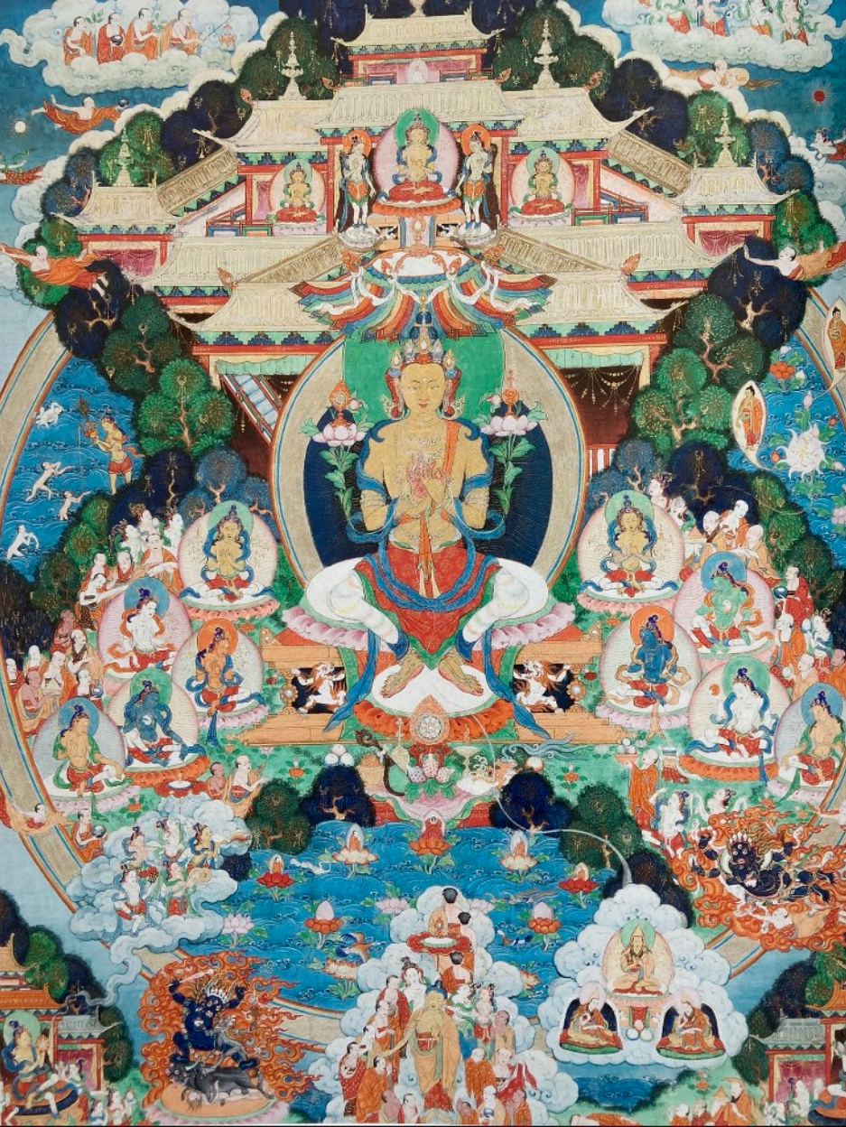
Maitreya in Tushita Heaven Bhutan, 19c thangka: pigment on cloth