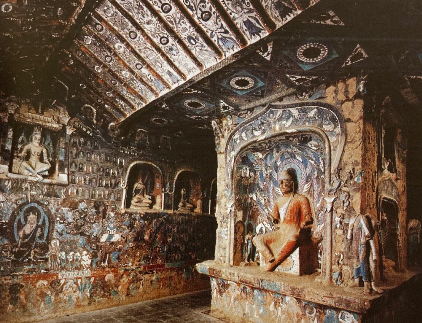
Interior of Cave 254 at Mogao; Dunhuang, Gansu Province, China; Northern Wei period, late 5th c.