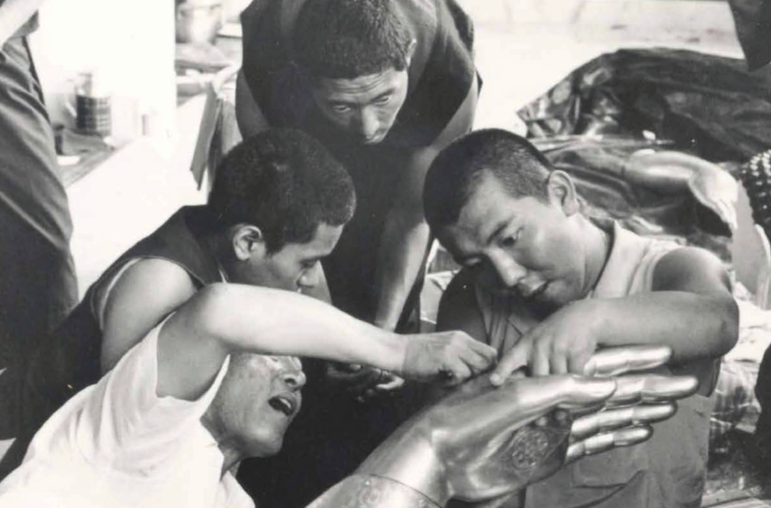
Filling Buddha Statue at the Rumtek Shedra with mantras and sacred substances excerpted from The Illuminating Orb of the Sun: Photographs Recalling the Incarnations of Jamgön Kongtrul , published by The International Kagyu Monlam Association, 2012