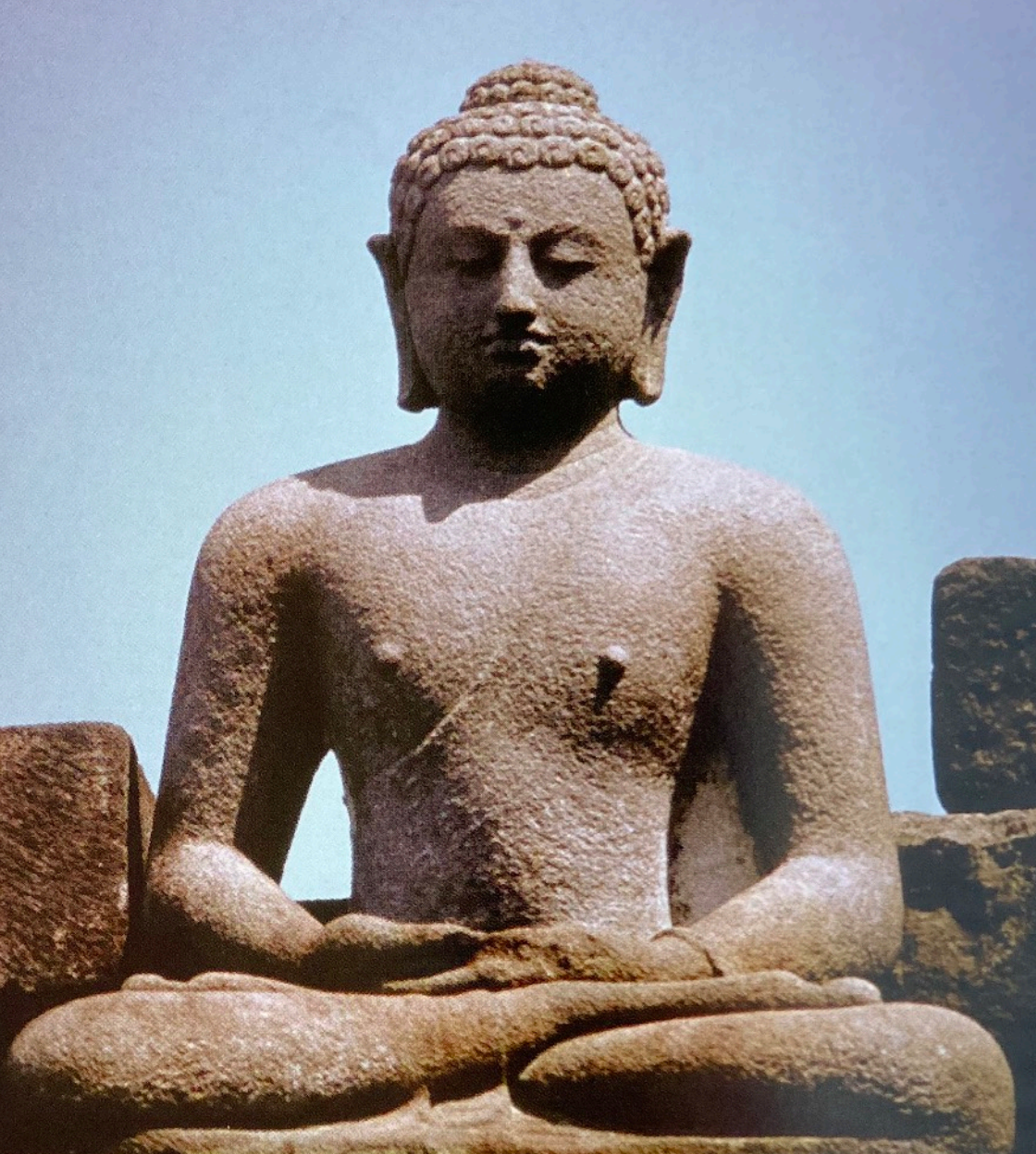
Buddha Amitabha, Borobudur, central Java, Indonesia, early 9th c Andesite, 106 cm; National Museum of Jakarta, Inv. #226.