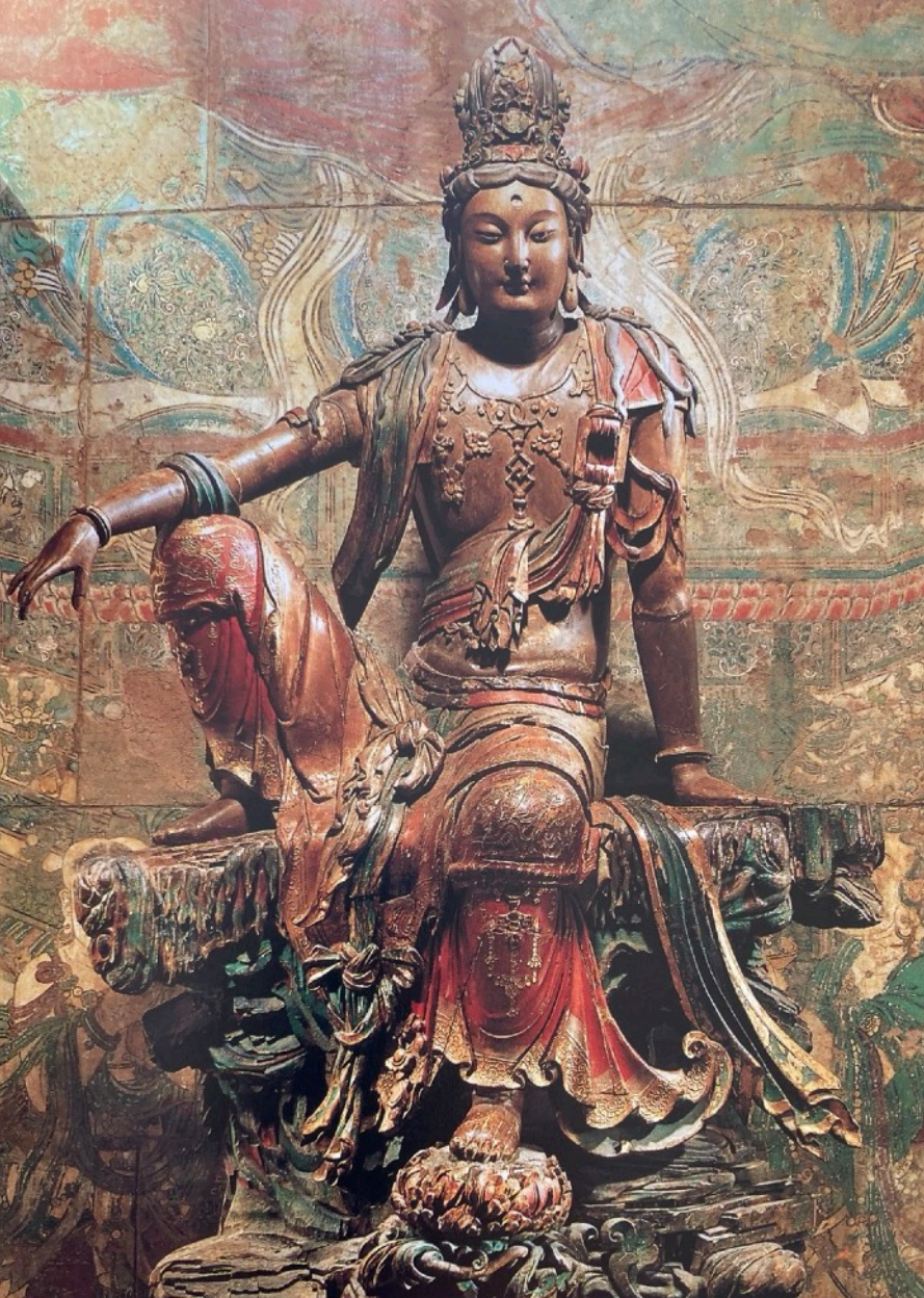
Bodhisattva Guanyin, late Song or Yuan dynasty, (ca 1127-1300), China wood and gesso, painted and gilded, 241 cm; The Nelson-Atkins Museum of Art, Kansas City, Missouri Purchase: Nelson Trust.