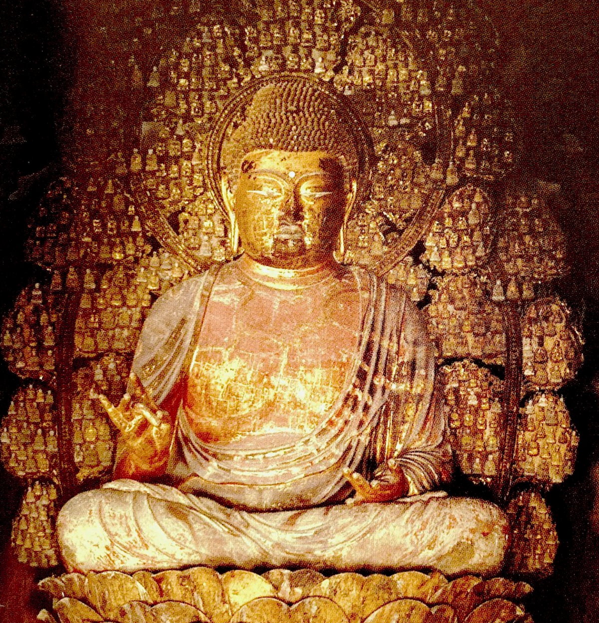
Buddha Vairochana (Dainichi or Roshana) Toshodai-ji, Nara, Japan, Nara period, 2nd half 8th c; Dry lacquer with gold leaf, 3.4 m